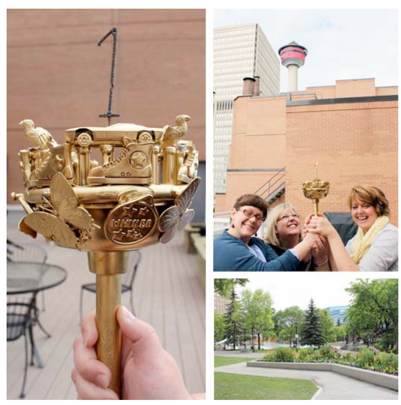
Commuter sceptre, designed by \underline{\mathsf{EPCOR}} Centre for Performing Arts.