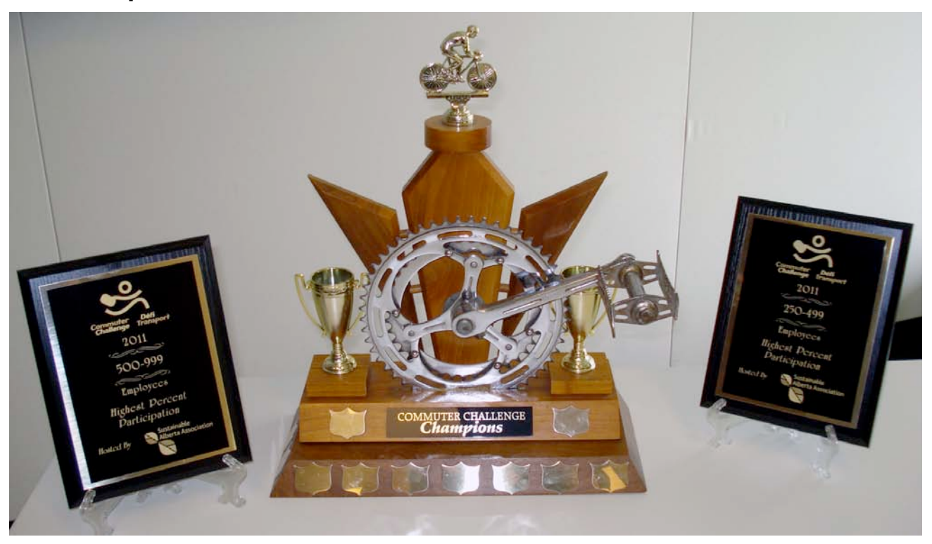
Trophy for the Commuter Challenge competition between the \underline{\text{Energy Resource Conservation Board}} and the \underline{\text{National Energy Board}}