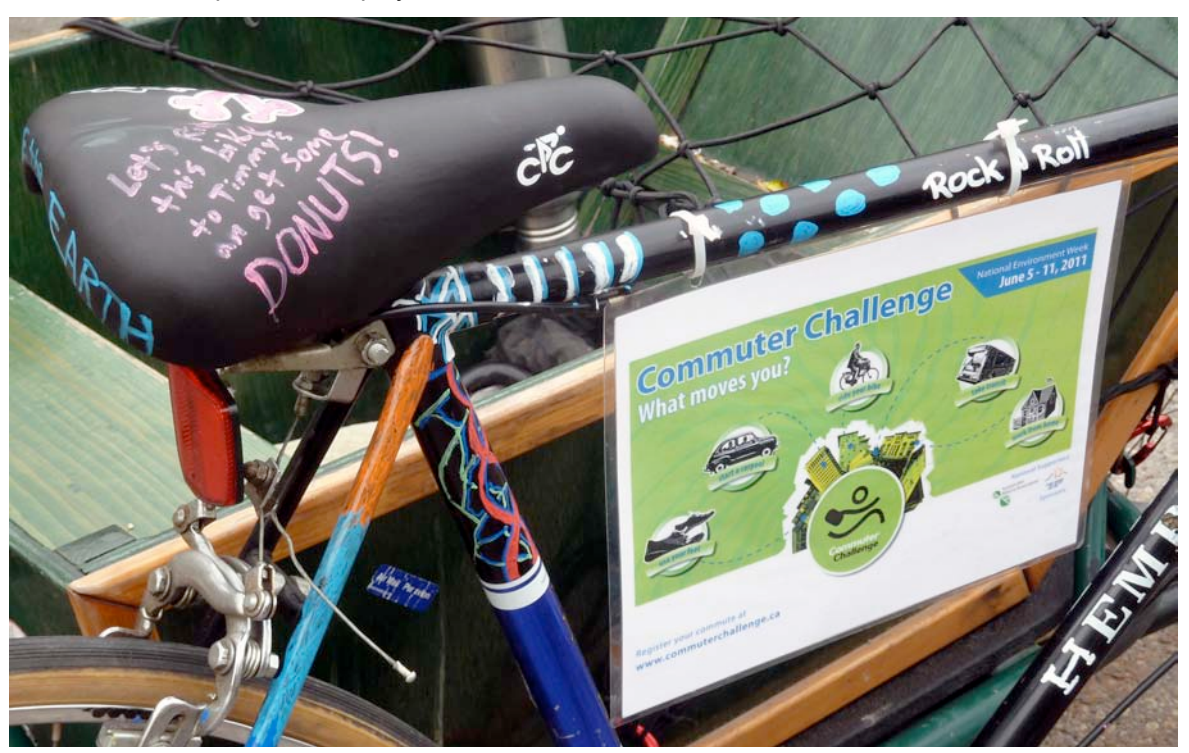
Bicycle message board: Messages on the seat and a laminated Commuter Challenge poster in front of the 10th Avenue Community Natural Foods store to show commitment to employees and customers.