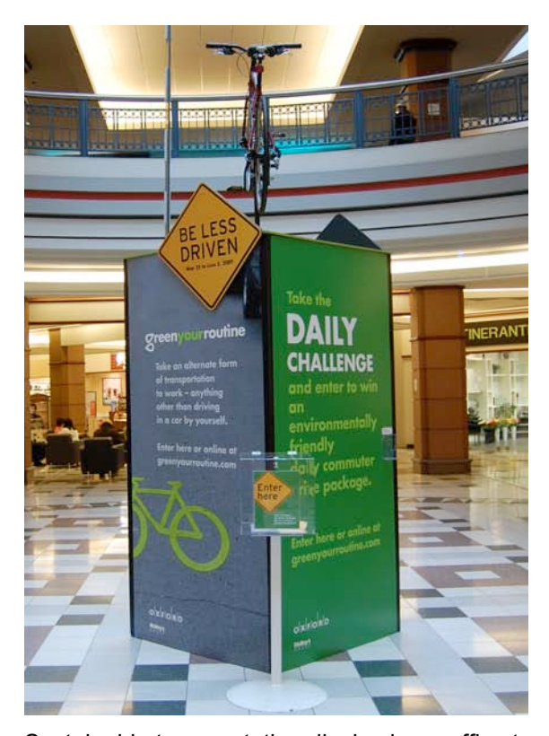
Sustainable transportation display in an office tower