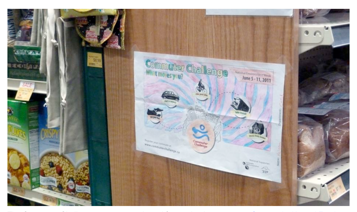
The Commuter Challenge poster was adapted for a colouring contest at <u>Community Natural Foods</u>; drawings were signed with the employee's name and department and displayed in different locations in the store